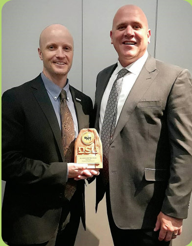
Chartway Proudly Accepted the Sponsor of the Year Award from Dixie State University