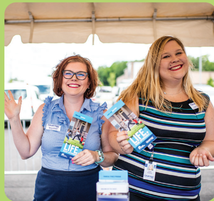
Team Members Making Life More Affordable in our Communities