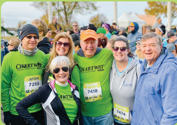
Board Members and Senior Leaders Participated in the Chartway Norfolk Harbor Race Weekend